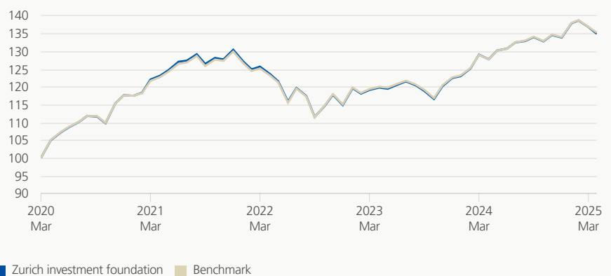
Performance (gross of fees, indexed)

The investment group invests worldwide in equities, bonds, real estate and alternative investments within the respective valid guidelines within the scope of the Swiss Federal Law on Occupational Retirement, Survivors' and Disability Pension Plans (BVG/BVV 2). The strategic equity component is 45%.